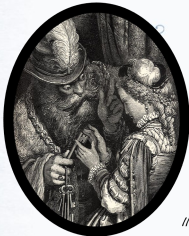
Illustration by Gustave Doré

If you miss more than 3 classes, with or without notice, I will ask to meet with you to discuss what's going on. I will accommodate absences for religious holidays and UConn-sanctioned activities (away games, etc.) with advanced notice .