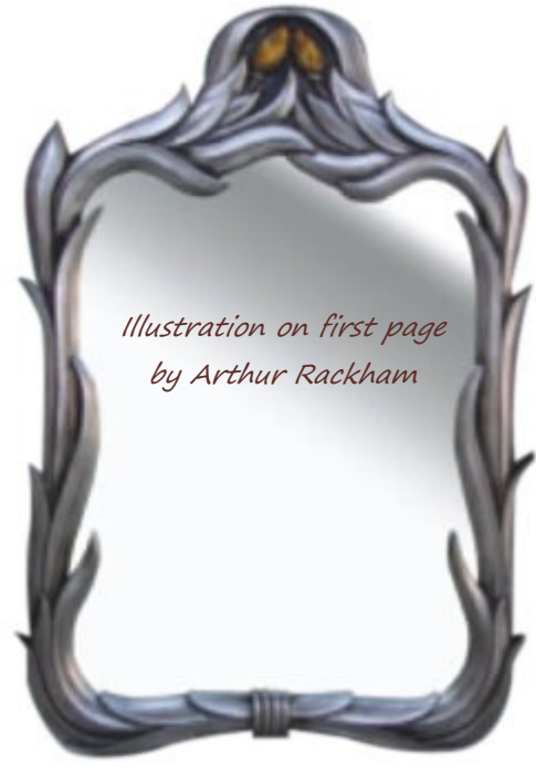
Illustration on first page by Arthur Rackham

Please contact me by email or phone to discuss academic accommodations that may be needed during the semester due to a documented disability. If you have a disability for which you wish to request academic accommodations and have not contacted the Center for Students with Disabilities (CSD), please do so as soon as possible.